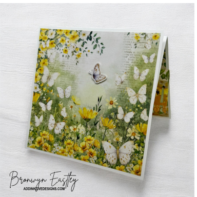
Card Front (when folded)