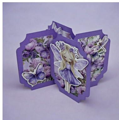
First 'Page' - Card Front