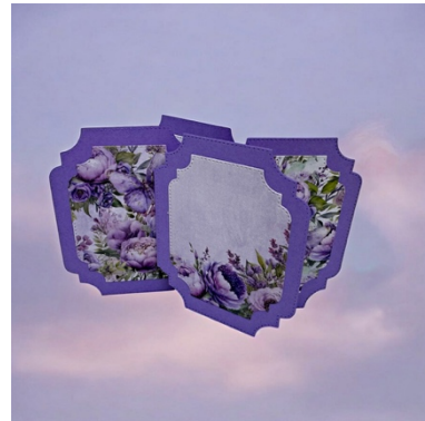
First 'Page' - Card Front