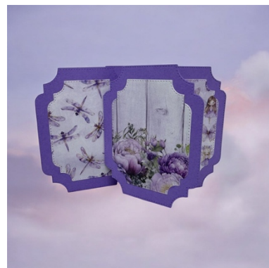
Third 'Page' - Card Back