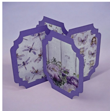
Third 'Page' - Card Back