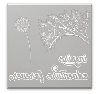
Sweet Silhouettes Dies