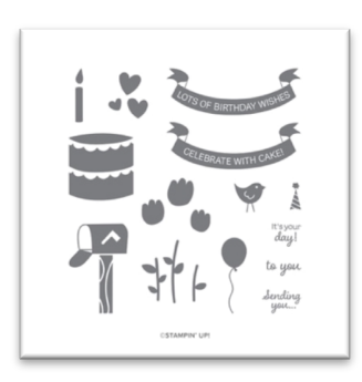
Celebrate with Cake

Tools & Adhesives: Tear & Tape Adhesive, Mini Glue Dots, Paper Snips, Paper Trimmer, Bone Folder, Stampin' Dimensionals